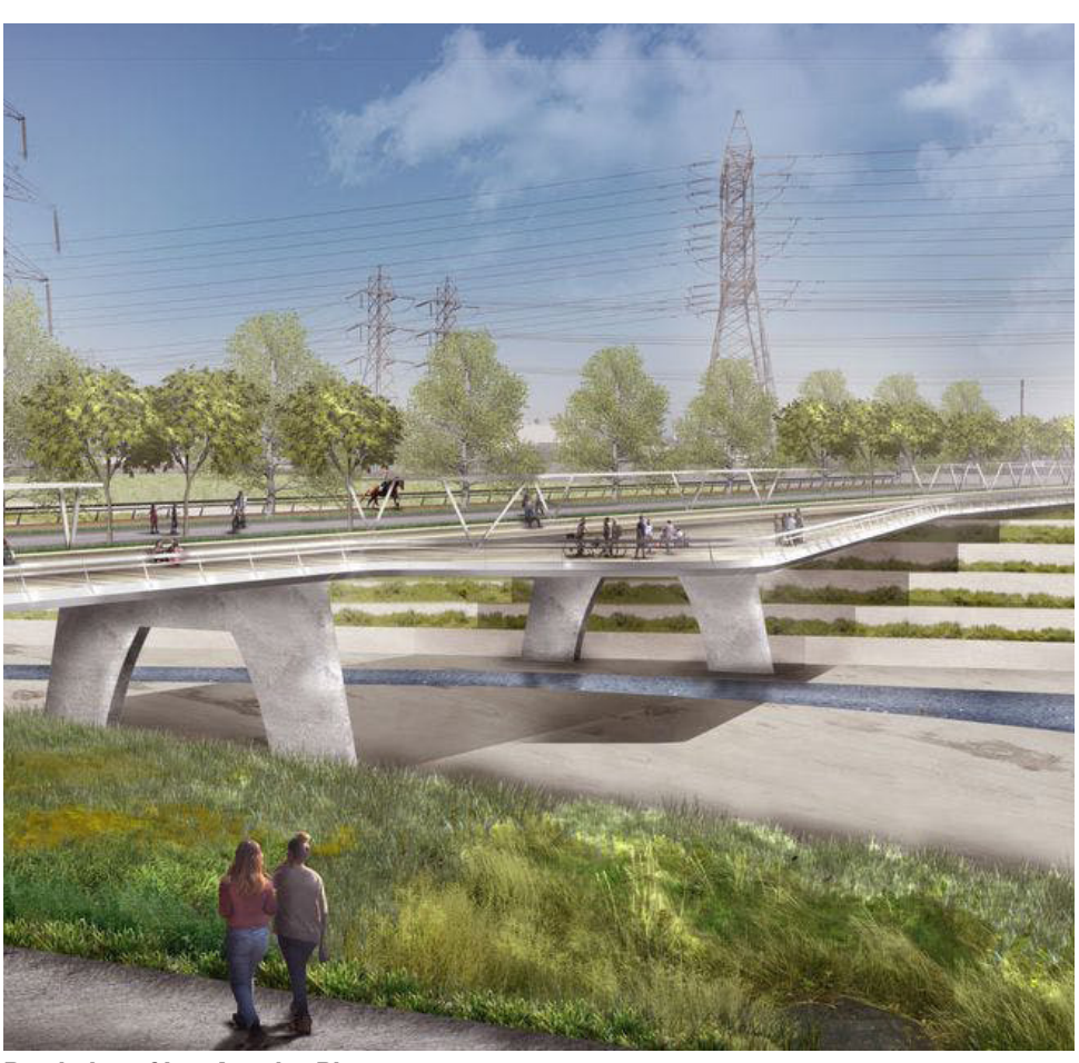
Rendering of Los Angeles River

Mayor Eric Garcetti today announced $3.55 million in State grants to help improve pedestrian, cyclist, and equestrian access to the L.A. River and support its wildlife habitat.